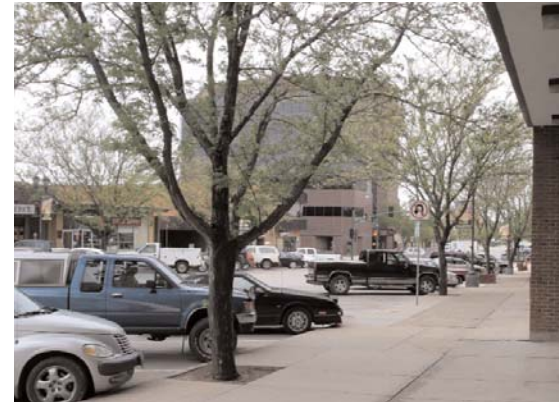
Above: A view of Gillette Avenue in downtown Gillette.