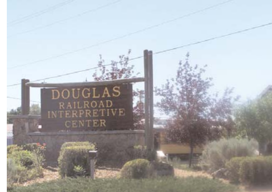
Above: Many attractions are found at the Douglas Railroad Interpretive Center.